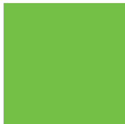
3033 FL Green