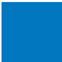
EL2768 NPT LB Bright Blue