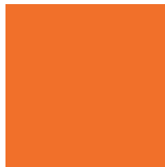
5018 FL Orange