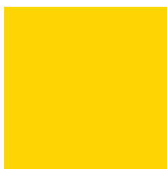
EL4611 NPT LB Yellow