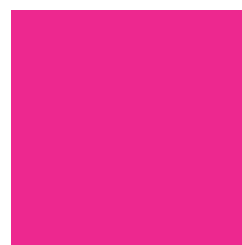
1018 FL Magenta