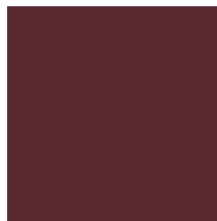
EL6399 NPT LB HO Burgundy