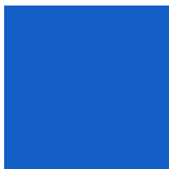
EL2449 NPT LB Lt Royal