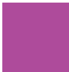
1037 FL Violet