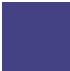
EL1570 NPT LB HO Purple