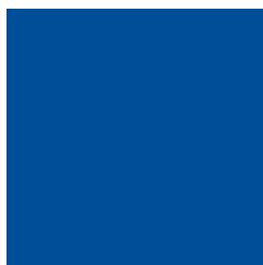
EL2584 NPT LB Royal