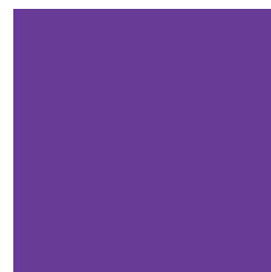
EL1212 NPT LB HO Team Violet