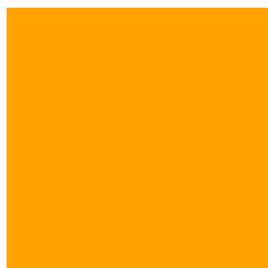
EL4202 NPT LB Gold