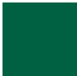
EL3399 NPT Forest Green