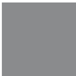
EL0730 NPT LB HO Grey