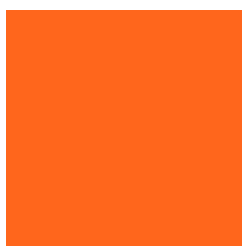
EL5202 NPT Lt Orange