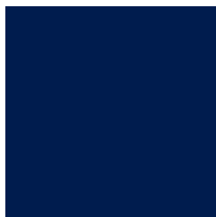
2442 Blue #2