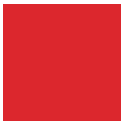
EL6279 NPT LB Red